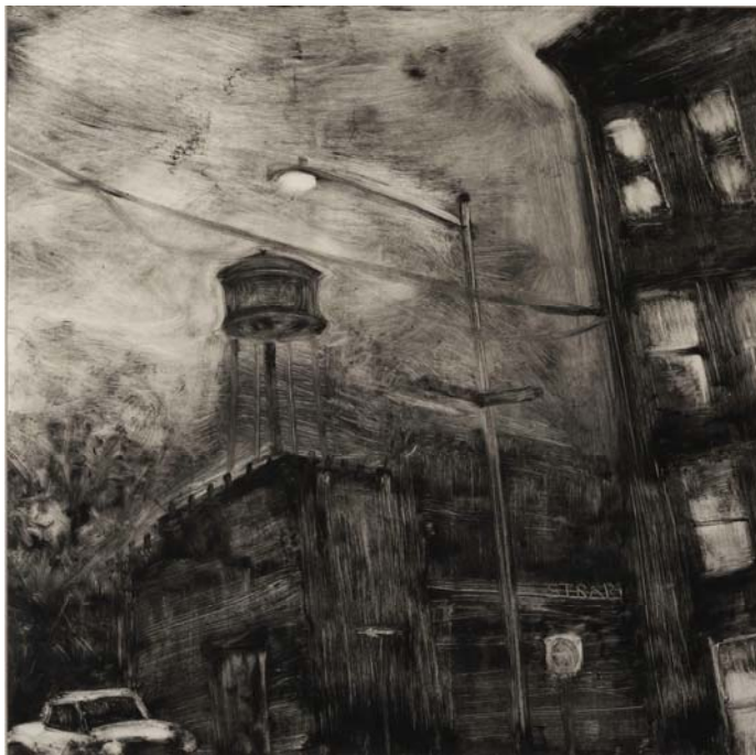
Streetlight and Water Tower Monotype by Kellyann Monaghan